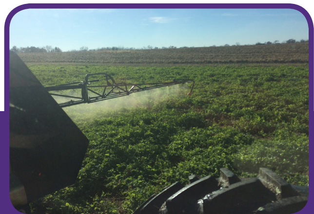
CX-1 Cover Crop Application